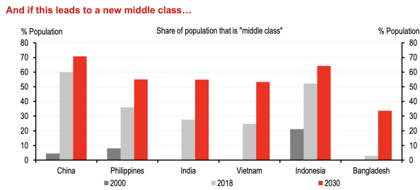
Figure 2: EM Middle Class

We believe India will be an interesting growth market to look out for in 2021. Despite currently wrestling with an out of control pandemic, the country continues to innovate in tech and has an exploding middle class (see Figure 2); both are major drivers of economic growth. Nonetheless, there are many obstacles in the way. The level of inflation remains above the central banks target, a record 250m strike for the agricultural sector(!), and the aforementioned pandemic. However, with a emerging market such as India risks of this magnitude are not out of the ordinary - they simply must be accounted for. [2]